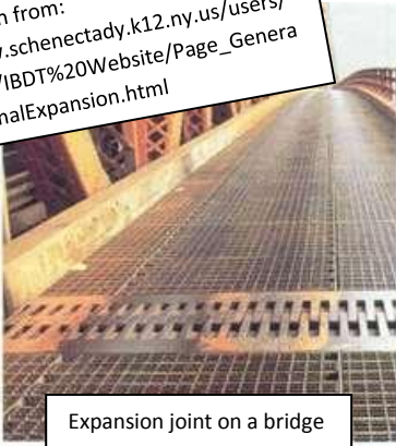
Expansion joint on a bridge